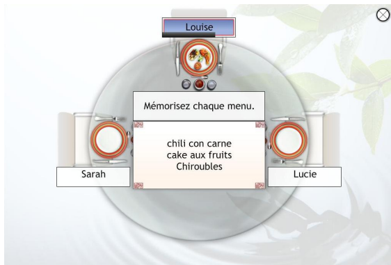
Figure 2. Example of an exercise meant to train verbal memory, where the user is requested to remember a list of dishes ordered by virtual clients.

The web service application offers 14 different cognitive exercises, adapted from Scientific Brain Training Pro software ( www.scientificbraintainingpro.com ), targeting verbal and visual memory, attention and vigilance, speed of processing, problem solving, verbal comprehension and visuospatial skills. The development process involved user tests with depressed patients for adjusting the exercises' difficulty. The user interface includes stress reducing stimuli (e.g. pictures of natural ponds) and the exercises were designed to be entertaining. For instance, a verbal memory exercise involves role playing as a waiter who has to remember the dishes ordered by clients (Fig. 2).